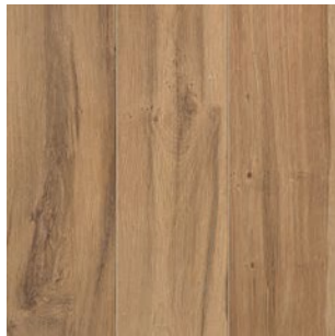
ROVERE VENICE 20MM