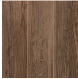
NOCE HICKORY 20MM