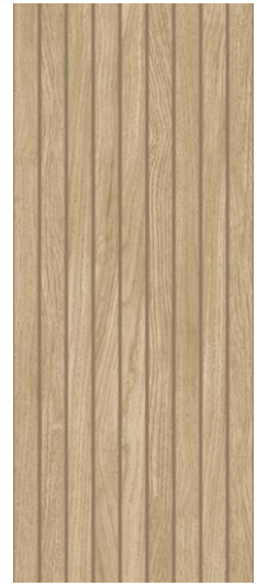
OAK PLANK & DECOR