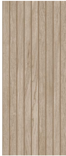
ELM PLANK & DECOR