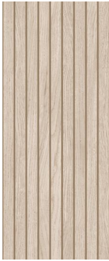
BIRCH PLANK & DECOR